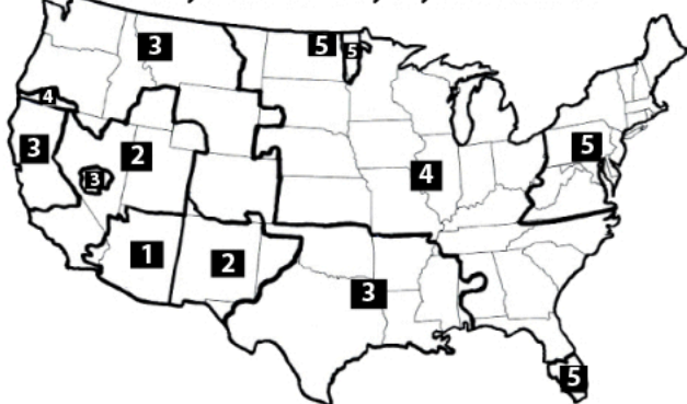
UPS Day-Certain Delivery Days From Arizona

Number of delivery days from the date of shipment to your location. Calculate working days only. Do not include Saturdays, Sundays or Holidays.